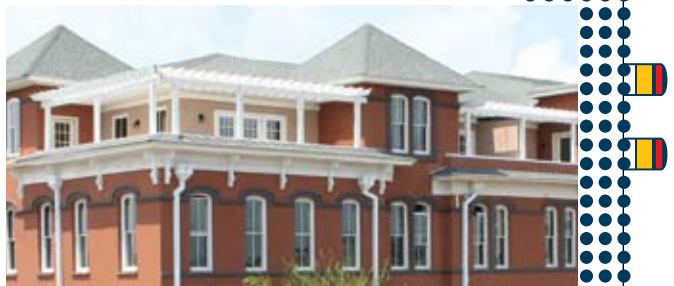
The Mitchell house has a second life as city lofts and condominiums.

Today, the rich and famous, along with those on a budget, continue to travel to this beautiful Southern city and everyone finds that Thomasville is worth the trip.